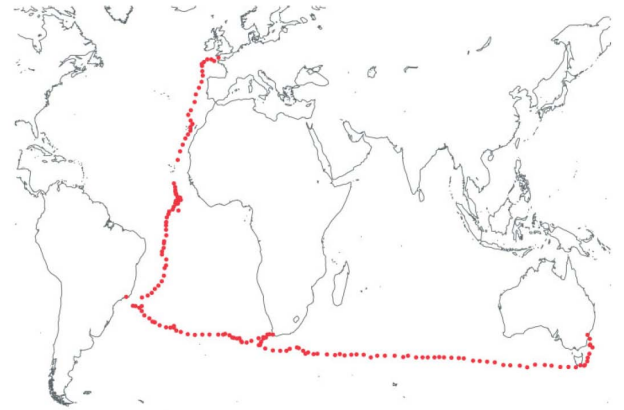
Figure 1: Route taken by HMS Sirius (Gergis et al., 2010).

The sky blackened, the wind arose and in half an hour more it blew a perfect hurricane, accompanied with thunder, lightening and rain...I never before saw a sea in such a rage, it was all over as white as snow...every other ship in the fleet except the Sirius sustained some damage...during the storm the convict women in our ship were so terrified that most of them were down on their knees at prayers.