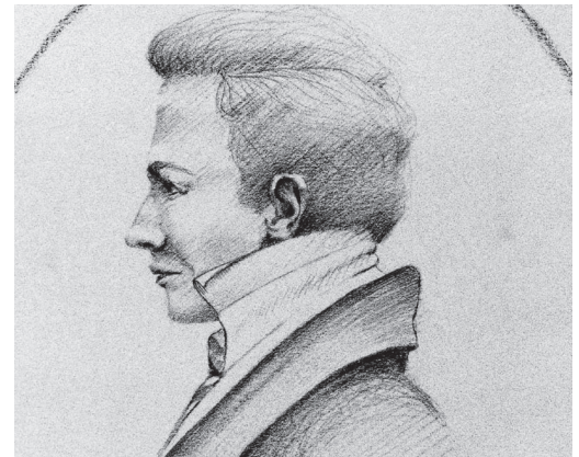
Artwork: Lieutenant William Dawes.

The SEARCH team digitised the instrumental observations from Dawes and Bradley in 2008 and went on to compare the readings with anecdotal evidence and independent palaeoclimate reconstructions.