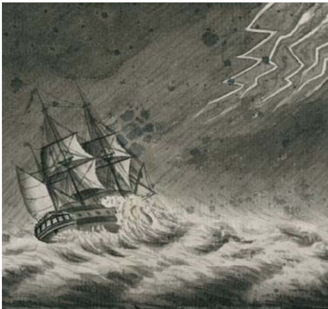
Artwork: 'HMS Sirius Weathering Tasman's Head.'

The team recently used two of Australia's oldest weather records to provide a unique insight into the conditions experienced by members of the First Fleet during their journey to Australia and in the first few years following European settlement in 1788.