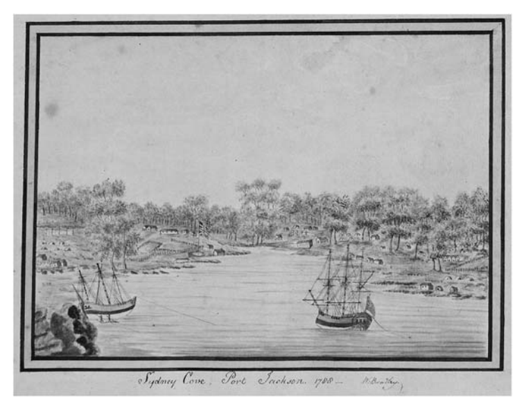
Figure 1. Early View of Port Jackson, by William Bradley, 1788.